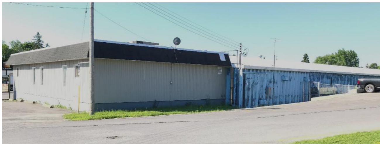
View of the North Façade