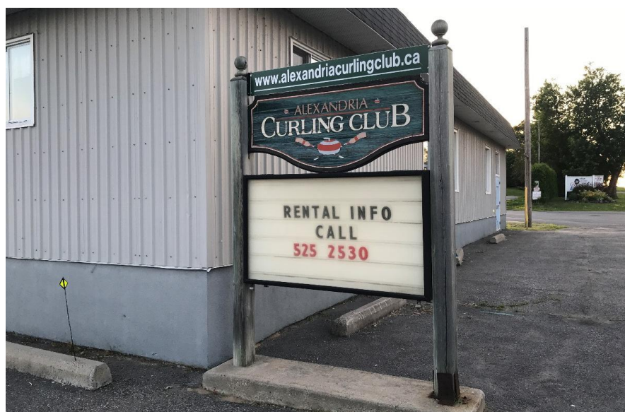
Photo of the existing signage

Program C eligible expenses are $1,750.85