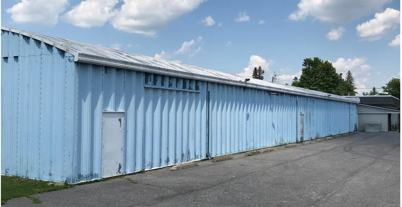
View of the West façade (looking towards Main Street)