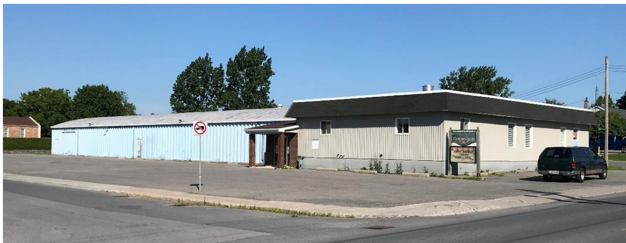
Front facade - South Side