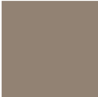
Sierra Tan SR:0.38 E:0.85 SRI:40