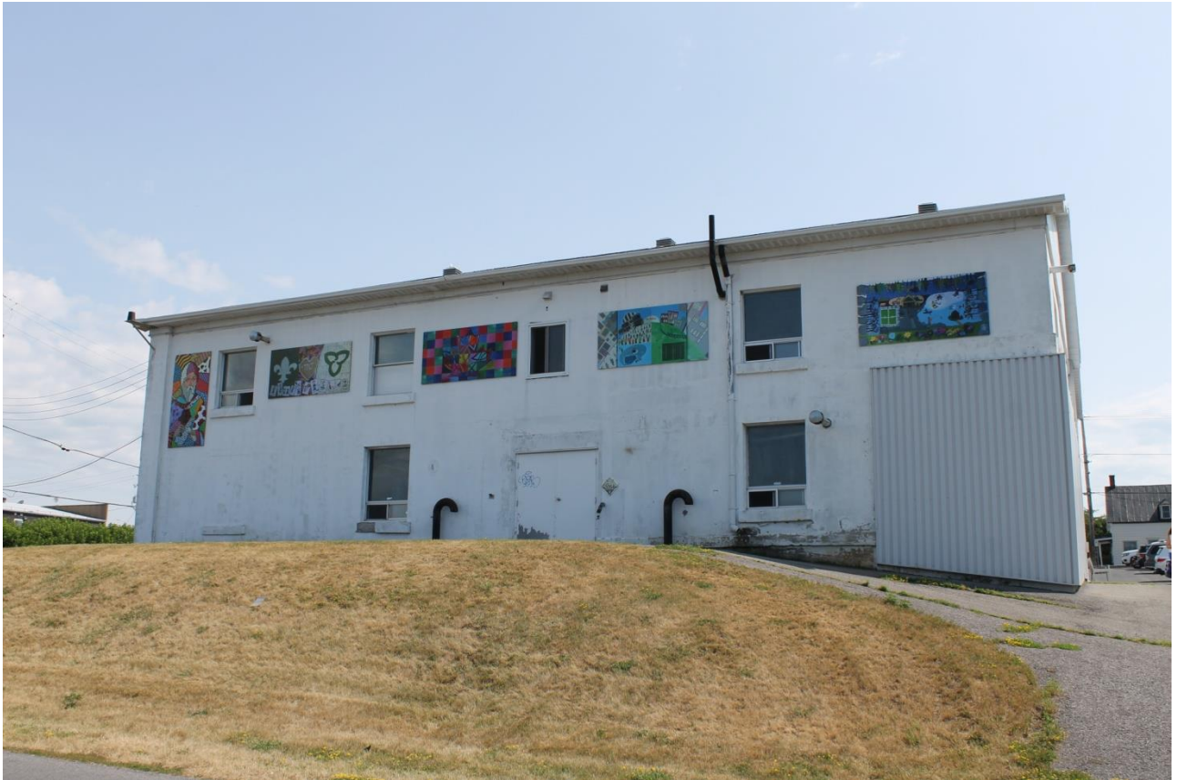
Picture of Alexandria Water Treatment Plant prior to renovations