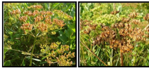
Seed production (left). Seeds drying up and beginning to fall off (right).