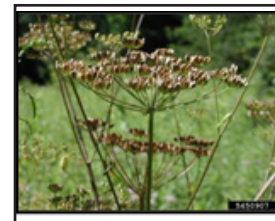
Wild Parsnip in seed

Below are GENERAL timing guidelines. The best mowing time may differ based on individual plants. Do not mow if the plant has gone to seed.