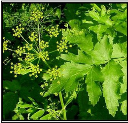
Wild Parsnip leaves and flower umbel