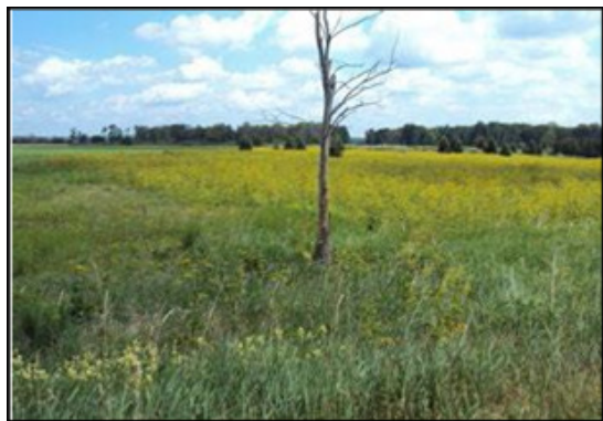
Wild Parsnip invading an agricultural field

Wild Parsnip spends the first year or more as a basal rosette.