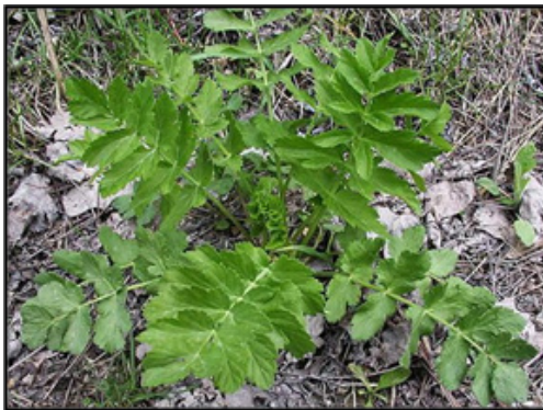
Wild Parsnip basal rosette