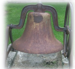
Glengarry Pioneer Museum