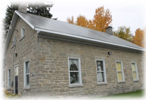
Kenyon Township Hall