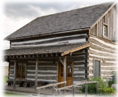
Glengarry Pioneer Museum

ALEXANDRIA • MAXVILLE • DOMINIONVILLE • APPLE HILL • GREENFIELD • DUNVEGAN • LOCHIEL • DALKEITH • GLEN SANDFIELD • GLEN ROBERTSON