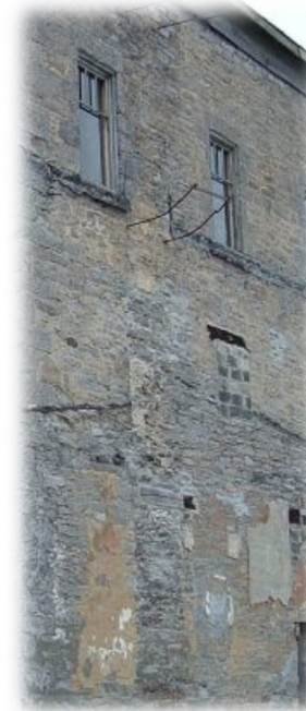
Old Mill Property (Priest's Mill)