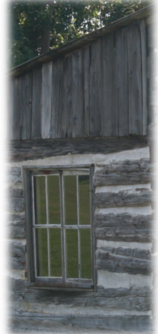
Blacksmith Shop, Pioneer Museum

NORTH GLENGARRY Ontario's Celtic Heartland